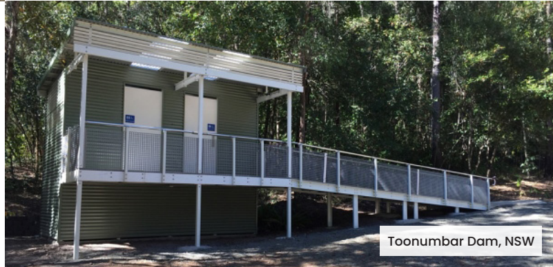
Toonumbar Dam, NSW

Our solutions align with sustainability goals and the specific needs of sensitive landscapes.