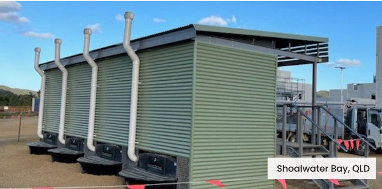
Shoalwater Bay, QLD

Today's public service engineers face significant challenges – do more with less, sooner, while being more ecologically sustainable, saving money and reducing risk all around. LooCube is stepping up to help address these challenges.